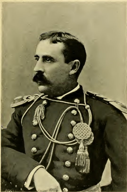
BRIGADIER-GENERAL SAMUEL S. SUMNER, U. S. V.